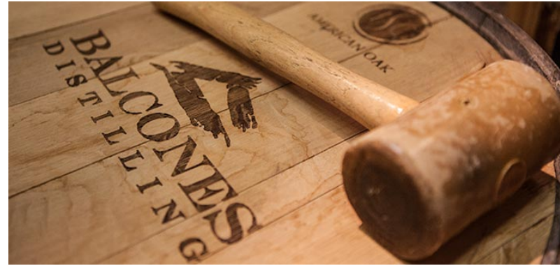
10:15 am Balcones Distillery Allow 1 hour for tour and tasting . Using Texas ingredients, this distillery has won awards from around the globe. Allow 30 minutes for boarding and drive time.

Allow 15 minutes boarding and drive time.