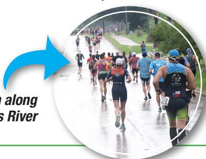
Triathlon along the Brazos River