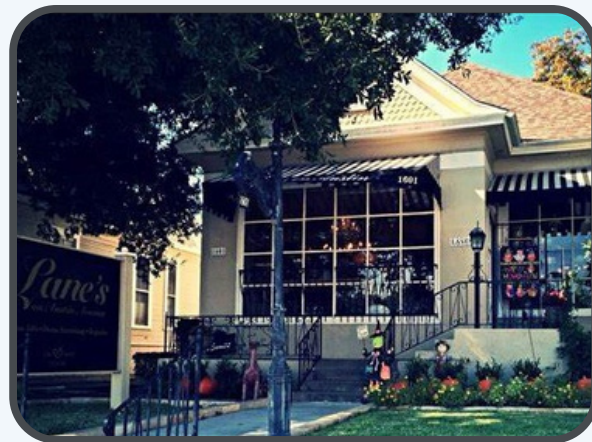
Lanes on Austin Avenue

If you know, you know. A place for those who enjoy the finer things in life, look to Lanes for home decor, gifts, china, crystal, collectibles, jewelry and much. much more.